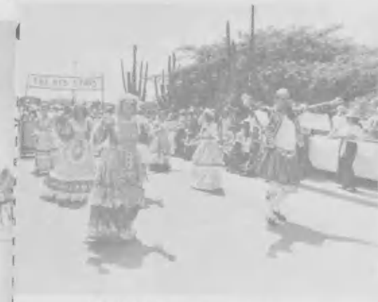
Greece Through The Ages